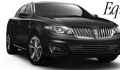
2009 LINCOLN MKS