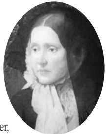
Julia Ward Howe

Anna Marie Jarvis (May 1, 1864, Webster, West Virginia – November 24, 1948, West Chester, Pennsylvania) is recognized as the founder of the Mother's Day holiday in the United States of America.